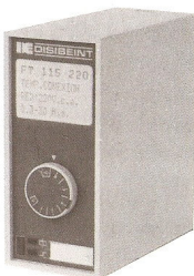
FT 115/215 Built-in control